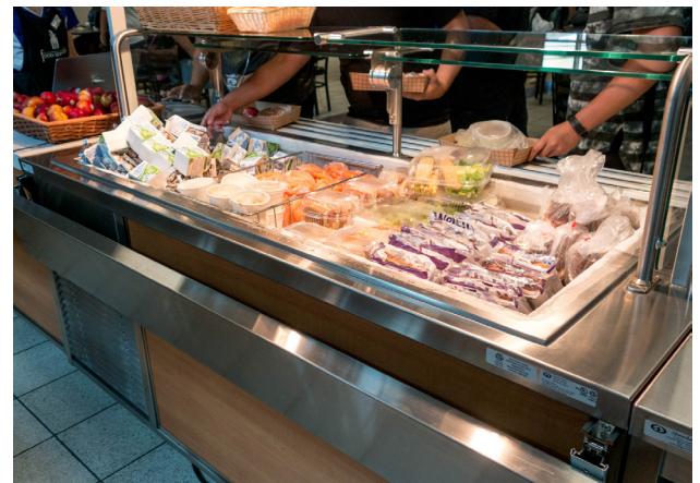
Work Shelf as shown fold down on SB76