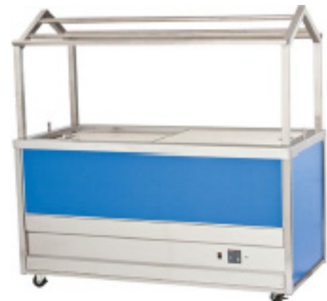
MD6226 as shown on on H5 Heated Speedline Cabinet.