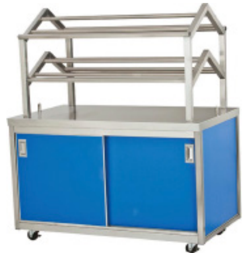
MD54262 as shown on Speedline D5430 Merchandising Cabinet with Sliding Door accessory.